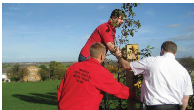
Grange Park, West Kirby

The Grange Park area of West Kirby saw environmental improvements led by the Friends of Grange Park residents' group with the planting of cherry trees and a lantern making workshop with children and young people. Tower Grounds in New Brighton saw local residents lead on an environmental audit with agencies. Work was undertaken in partnership with Leasowe Community Homes, taking the opportunity to speak with residents and young people attending the annual 'Unity in our Community' Halloween fancy dress party.